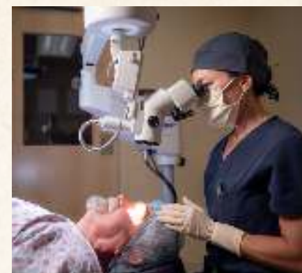
Sansum Clinic, now part of Sutter Health