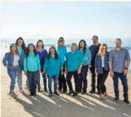
Blue Planet Eco-Eyewear

In 2014, SEE launched the annual Humanitarian of the Year Award to honor the outstanding dedication and achievement of volunteer ophthalmologists, local optometrists, and partner organizations that are committed to making eyecare more accessible worldwide. Please join us in recognizing and celebrating the wonderful 2024 recipients of this award!