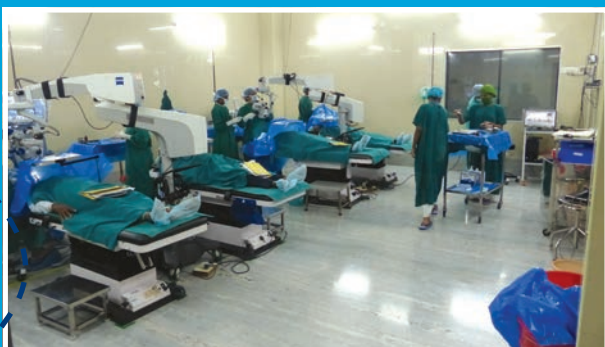
Figure 1. One OR at the Aravind hospital in Madurai. Two surgeons alternate between two adjacent operating beds by swinging the microscope from one table to the other.