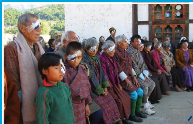
Figure 7. Postoperative cataract patients in Nepal.