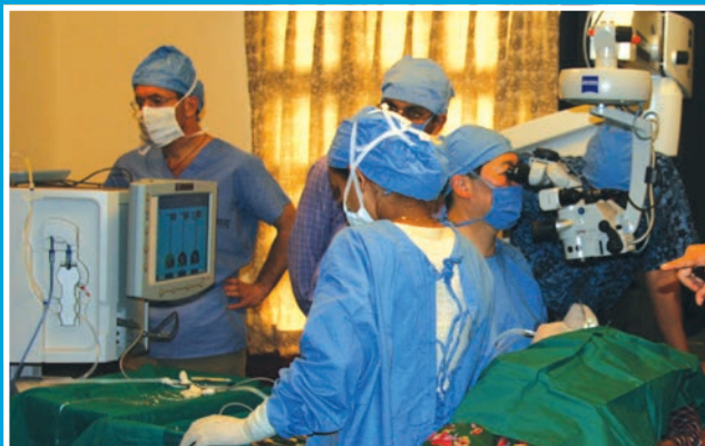
Figure 4. The author performing phacoemulsification within a makeshift OR at the Pulihari Monastery in Nepal, 2005.