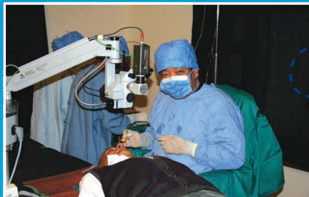
Figure 5. Dr. Ruit performing MSICS within a makeshift OR at the Pulihari Monastery in Nepal, 2005.