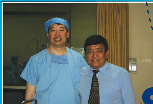
Figure 9. The author and Dr. Ruit in Kathmandu, Nepal, 2005.

IOLs we used significantly prevented PCO, and they were even statistically superior to square-edged AcrySof foldable IOLs (Alcon) used in a separate, parallel 9-year study. 6