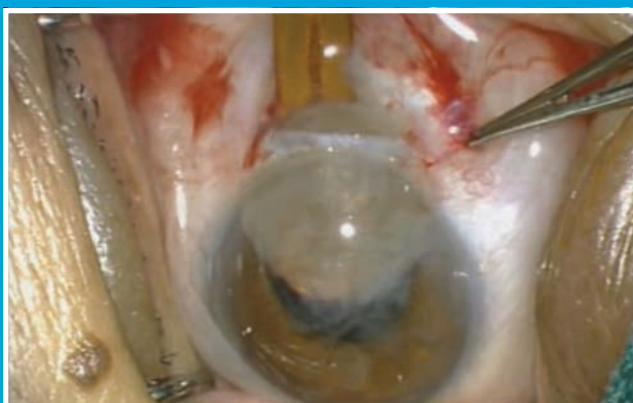
Figure 6. Dr. Ruit performing MSICS on a white cataract using an irrigating cannula.